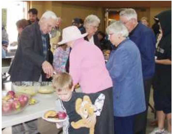
The Street Lunch BBQ sponsored by the Men’s Group on Oct. 25th was appreciated by about 125 attendees.